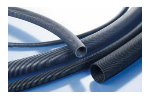
Conduits: PLR (PA6) and PCSL (PA12) conduits with high-grade, specially formulated polyamide. Very good flammability characteristics and mechanical performance

As a leading manufacturer of top quality cable protection systems since 1975 we know our customers needs. Coming with a comprehensive standard portfolio that is easy to install and maintain, PMA conduits and fittings have an attractive priceperformance ratio with respect to the cost price and the operating costs, combined with high mechanical performance and fire safety certification up to EN45545-2 HL3 internal. For more detailled product information please visit our website www.pma.ch.