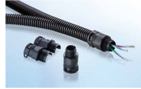
PMA Divisible System for retrofit and repairs.