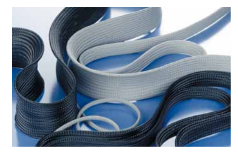
Braids F.66, C.66, L.66, F.PX, L.PX, G.PX for simple bundling and abrasion protection for cables and wires.