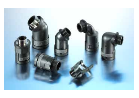
Fittings: PMAFIX IP68GT single piece fittings with integrated strain relief optimally holds and