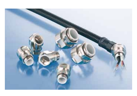
Accessories: Wide range available.