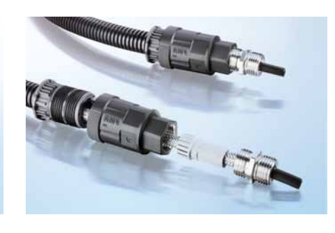
PMA EMC System providing electro-magnetic shielding.