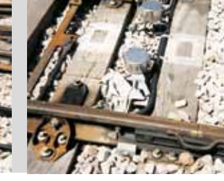
PMAFIX and PMAFLEX in points control systems