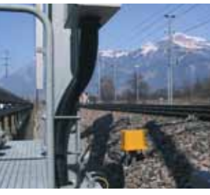
PMAFIX Pro and PMAFLEX in signal installations