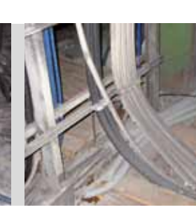
PMAFIX and PMAFLEX in tunnels